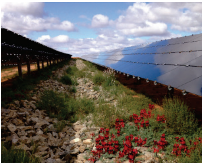
53 MW solar farm Broken Hill.