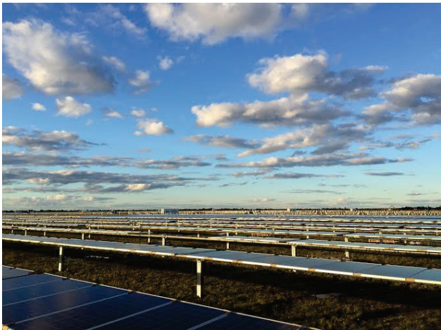
Moree Solar Farm

NSW is leading Australia in the development of large-scale solar projects. These projects support jobs and investment in regional NSW, diversify the State's energy mix and drive down costs for future large-scale solar developments.