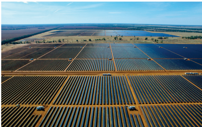
Nyngan Solar Plant